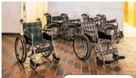
Ask at the Information counter

Wheelchairs: 28 (combined self-propelled or assisted) / free of charge