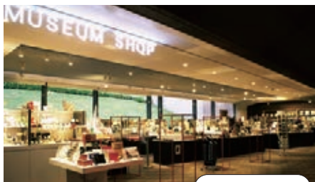
Central Wing LBF