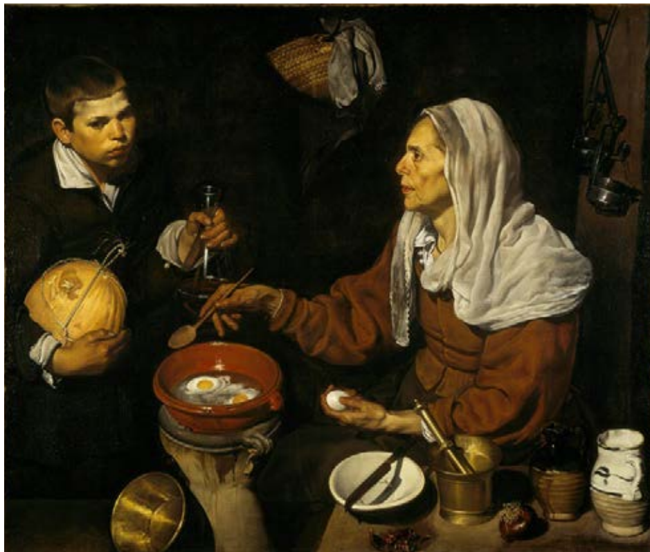
Diego Velázquez, An old woman cooking eggs , 1618, National Galleries of Scotland