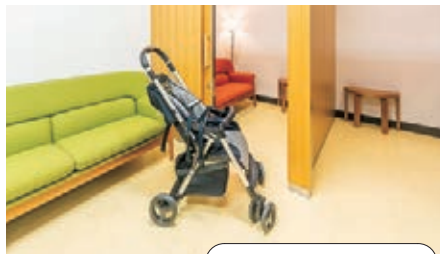
Ask at the Information counter

Baby strollers: 5 (2 for 2–24 months / 3 for 1–48 months) / free of charge