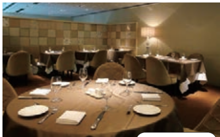
Interchange Wing 1F

Enjoy authentic French dining. Table reservations are welcome. Private rooms are also available. Area: 249 m 2 / 50 seats / Tel. 03-5832-5101