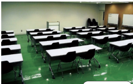
Interchange Wing 2F