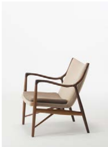
Finn Juhl, Easy Chair No.45 , designed in 1945, Oda Collection

Denmark—the design superpower. Through displays of chairs, this exhibition will trace the evolution of Danish furniture design. Placing a focus on designer Finn Juhl, who built the golden age of modern furniture, it will reveal the background that gave rise to his distinctively original designs.