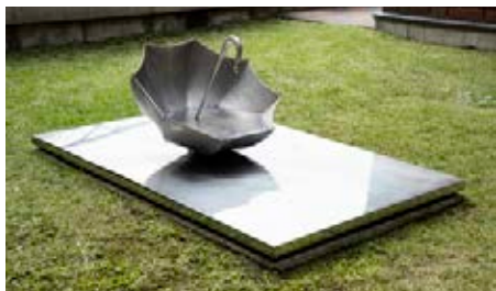
TATEHATA Kakuzo, SAKASA (Inverted Umbrella) , 1973