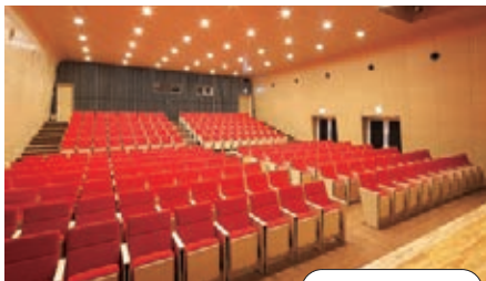
Interchange Wing LBF

Area: 284 m 2 , stage 30 m 2 / capacity: 230 (225 fixed seats + 5 wheelchair spaces)