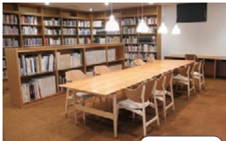
Interchange Wing 1F

Area: 88 m 2 / 14 seats / Some 50,000 library materials