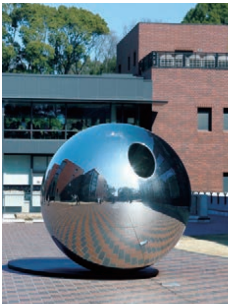
INOUE Bukichi, my sky hole 85-2: light and shadow , 1985