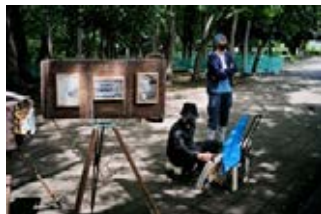
Bokka, Mobile gallery+Mobile sketch stand , 2021 (Reference work)

An open call exhibition seeking to encourage contemporary artists in their pursuit of art from new perspectives. Featured this year—exhibitions by three artist groups that explore the possibilities of the museum's distinctive spaces through works of varying genres.