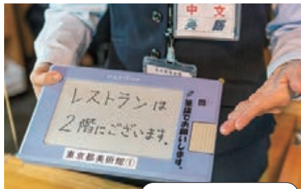
Ask at the Information counter

An electronic writing pad and letter/symbol boards are on hand at the Information counter. For use in Japanese, English, and Chinese.