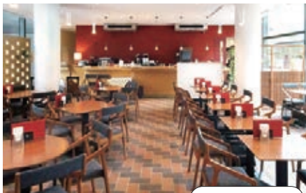
Central Wing 1F

Area: 103 m 2 / 50 seats / Tel. 03-5832-5566