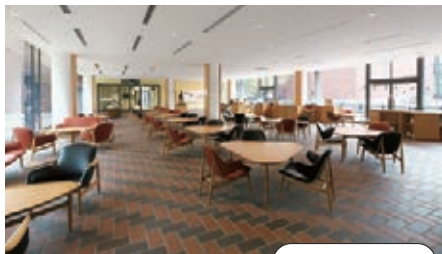
Central Wing 1F

Area: 391 m 2 / 52 seats / 6 internet terminals