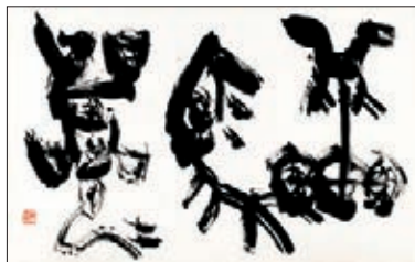
AOYAMA San'u, Busy with Coaches and Horses

The collection of the Tokyo Metropolitan Art Museum is composed of 12 works of sculpture and 36 works of calligraphy.