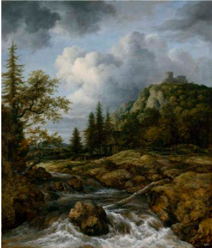
Jacob van Ruisdael, Waterfall with a Castle on a Mountain , ca.1665/70, Gemäldegalerie Alte Meister, Dresden