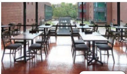
Central Wing 2F

Area: 481 m 2 / 200 seats / Tel. 03-5832-5551