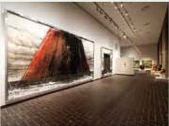
New-wave Artists 2015 — From the Public Entry Exhibition view

An exhibition introducing up-and-coming artists of great promise, selected from among artists appearing in “Best Selection 2015” and exhibited in solo exhibition format. Visitors can look forward to artworks infused with powerful individuality.