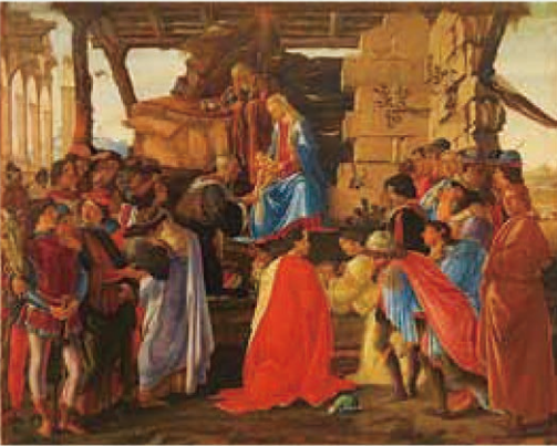
Sandro Botticelli, Adoration of the Magi, c.1475-76 Galleria degli Uffizi

The first large-scale exhibition in Japan devoted to the Italian Renaissance painter Sandro Botticelli(1444/45–1510). The exhibition will trace the vicissitudes of Botticelli’s life and art through works from every period of his career. Included will be paintings by his master, Fra Filippo Lippi, and Lippi’s son, Filippino Lippi.