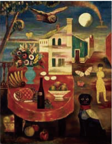
KOGA Harue, Innocent Moonlit Night , 1929 Ishibashi Museum of Art, Ishibashi Foundation

The Nika Association stands out, even among the many art groups whose activities occasioned this museum’s founding. The list of legendary Yoga (Western-style) painters who exhibited in the Nika Association Exhibition includes such names as KISHIDA Ryusei, Saeki Yuzo, KOIDE Narashige, SEKINE Shoji, KOGA Harue, FOUJITA Tsuguharu, MATSUMOTO Shunsuke, OKAMOTO Taro, and TOGO Seiji—not to mention Henri Matisse and other European masters. An exhibition of the history of 20th-century Japanese art through 100 years of art from the Nika Association.