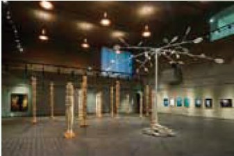
Mayhem, Friction, Silence, and then ... POST 3.11 (Installation view of Group Show of Contemporary Artists 2014)

A group exhibition of artists exploring new directions in contemporary art. The work of five groups spanning the genres of painting, sculpture, video, photography, and installation will be featured.