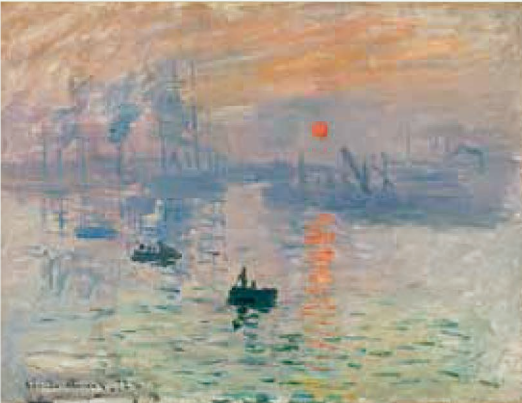
Claude Monet, Impression, Sunrise, 1872 Musée Marmottan Monet, Paris *The work Impression, Sunrise will be displayed for a limited period: 9/19-10/18

Presenting “Monet’s Monet collection” from Marmottan Monet Museum, an exhibition of works originally in the artist’s possession. Through some 90 pieces, ranging from family portraits to Monet’s late-period Water Lilies paintings filled with light and color, and artworks personally collected by Monet, we will explore Monet’s rich creative world. Featured will be Impression, Sunrise , the painting from which “Impressionism” took its name.