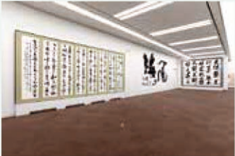
TOKYO “SHO” 2015 exhibition view

A cooperative exhibition by 18 public calligraphy groups based in the Tokyo-Kanto area. Featured are some 40 artists chosen by each group as representing the “rising generation of calligraphers”. Contemporary calligraphy of many genres—Kanji, Kana, Modern Poetic Calligraphy, Large Character Calligraphy, Seal Engraving, Carved Characters and Avant-garde Calligraphy—will be presented in one venue, with a focus on recent works, to demonstrate the power and beauty of “Tokyo Calligraphy Today.”