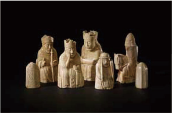
The Lewis Chessmen, AD 1150-1200

The British Museum, a repository for the cultural treasures of humankind, houses a vast collection of artefacts from almost every world region and historical period. The exhibition will trace humanity’s journey of 200,000 years from prehistory to modern times through 100 pieces from the British Museum’s collection. Visiting Japan will be artefacts of legendary fame, prominent even among the noted works in the collection. These include the “Lewis Chessmen” which appeared in the first Harry Potter Hollywood movie.